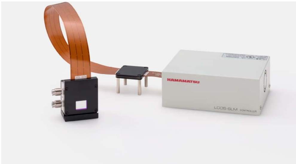
LCOS-SLM X15213-03CL with the world's highest power handling capability

Hamamatsu Photonics has developed a new LCOS-SLM (Liquid Crystal On Silicon - Spatial Light Modulator), the X15213-03CL, that delivers the world's highest power handling capability up to 700 W. We did this by harnessing our unique thermal design technology which enhances heat dissipation performance.