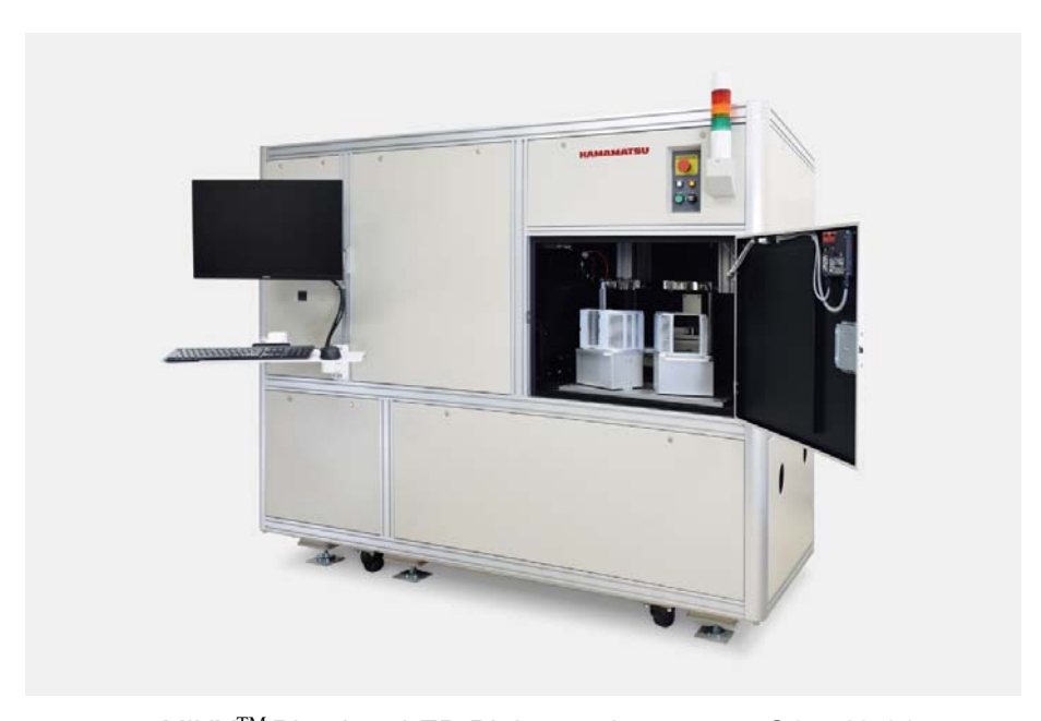
MiNY<sup>TM</sup> PL micro-LED PL inspection system C15740-01