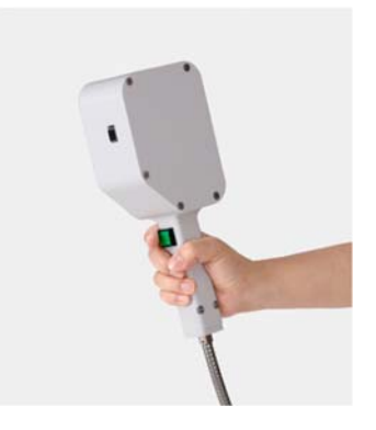
(Left) Measurement using previous product (Right) Handy probe head of C16356